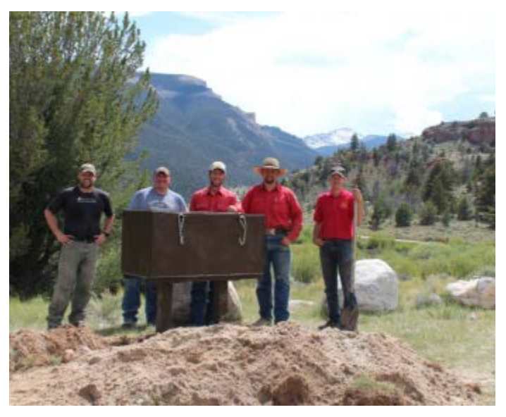
Western Bear Foundation