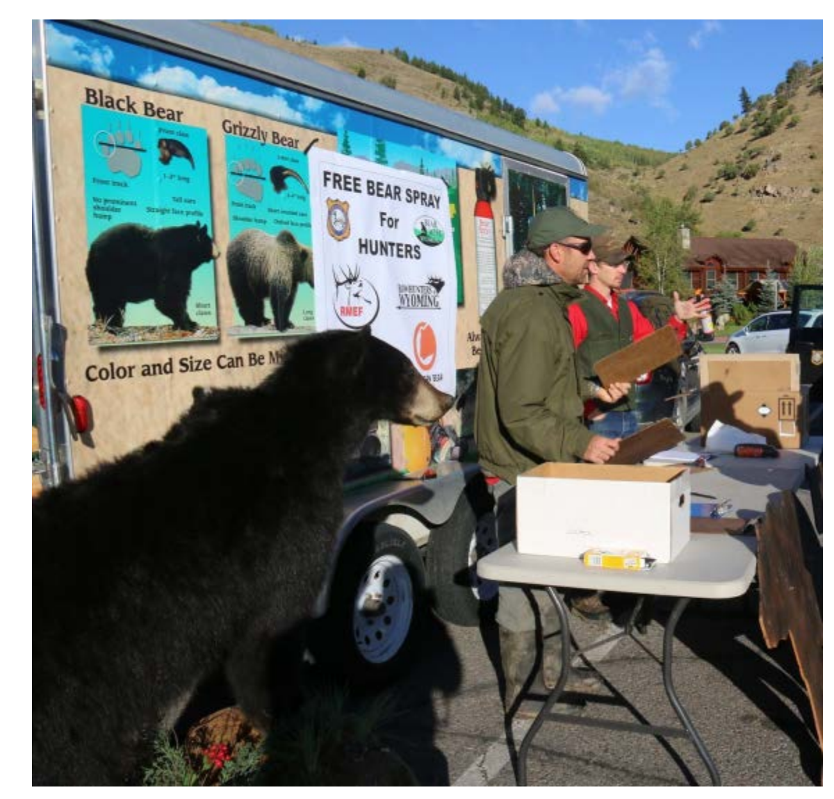
Western Bear Foundation