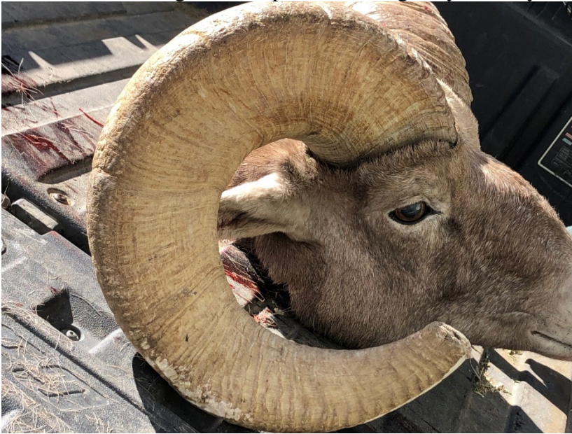
Photo 3. Mature bighorn sheep hit along Hwy 34 in Sybille Canyon, May 2021